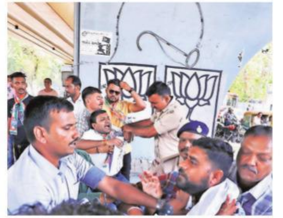
Congress workers protesting against a drawing of BJP's electoral symbol, 'Lotus', over a mural of Mahatma Gandhi are being detained by police in Ahmedabad.

A symposium for public prosecutors will be organised by the Gujarat National Law University (GNLU) on June 12, with aim to increase conviction rate of criminal cases in the state.