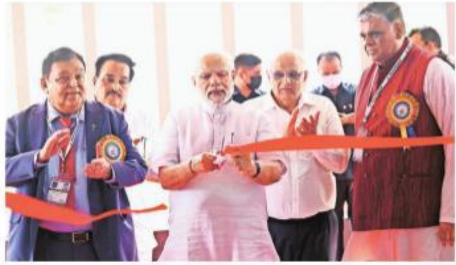
PM Narendra Modi inaugurates AM Naik Healthcare Complex and Niral Multi Speciality Hospital in Navsari.

Citing several examples of healthcare initiatives taken in Gujarat, PM Modi narrated how these schemes launched during his tenure as chief minister of the state benefited the weaker sections of the society. "In Gujarat, health infrastructure has improved and health indicators are