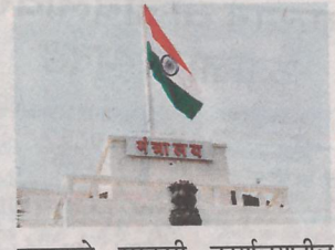
सरकारने सरकारी कार्यालयातील कर्मचाऱ्यांच्या उपस्थितीवर बरीच मर्यादा घातली होती. लॉकडाउन जाहीर झाला,

सर्वसामान्यांची कामे अडू नयेत यासाठी निर्णय