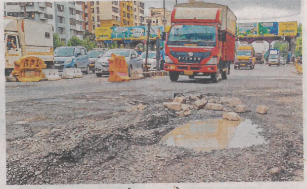
मुलुंड टोलनाक्याजवळ पडलेला भलामोठा खड्डा.

मागील काही दिवसांपासून कोसळत असलेल्या मुसळधार पावसाने रस्त्यांची चाळण केली आहे. त्यामुळे मुंबईच्या विविध भागांत खड्ड्यांचे साम्राज्य पसरण्यास सुरुवात झाली आहे. यंदाच्या १ जूनपासून आजतागायत खड्ड्यांच्या १४६ तक्रारी प्राप्त झाल्या आहेत. यापैकी १०९ खड्डे बुजविण्यात आले, तर उर्वरित ३७ बुजविण्याचे काम सध्या प्रगतीपथावर आहे, अशी माहिती पालिकेच्या वतीने देण्यात आली आहे.